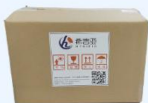
Package in Carton Box