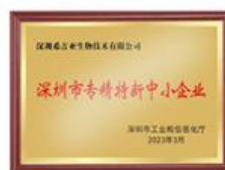
"Specialized and Special new" Enterprises in Shenzhen

Hygieia will use AI technology to quickly design and create new protein molecules, and combine new enzyme engineering technology to achieve more accurate, more efficient and more economical development of biological macro-molecular products and industrial biological enzymes, so as to achieve technological breakthroughs in the field of synthetic biology and protein engineering technology. Our products have been certified by many third-party testing institutions, including microqualitylab, SGS, Intertek,