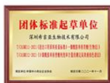
NMN Group Standards for Food and Cosmetics