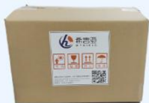
Package in Carton Box