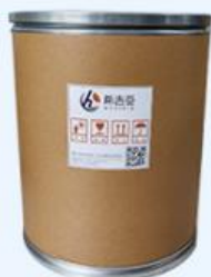
Package in Drum