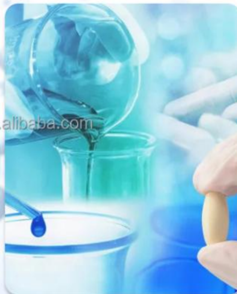
New Products Development