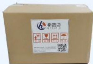
Package in Carton Box