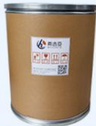
Package in Drum