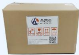
Package in Carton Box